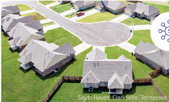
South Haven, Clarksville, Tennessee