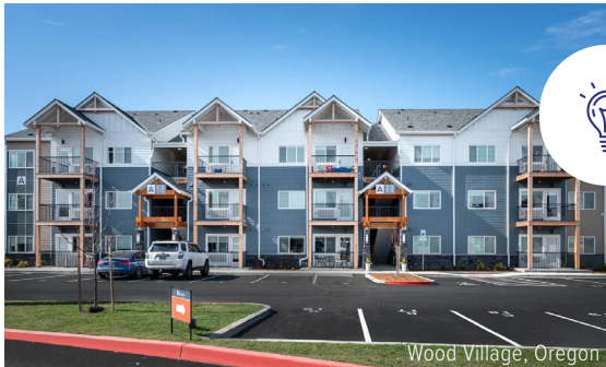
Wood Village, Oregon